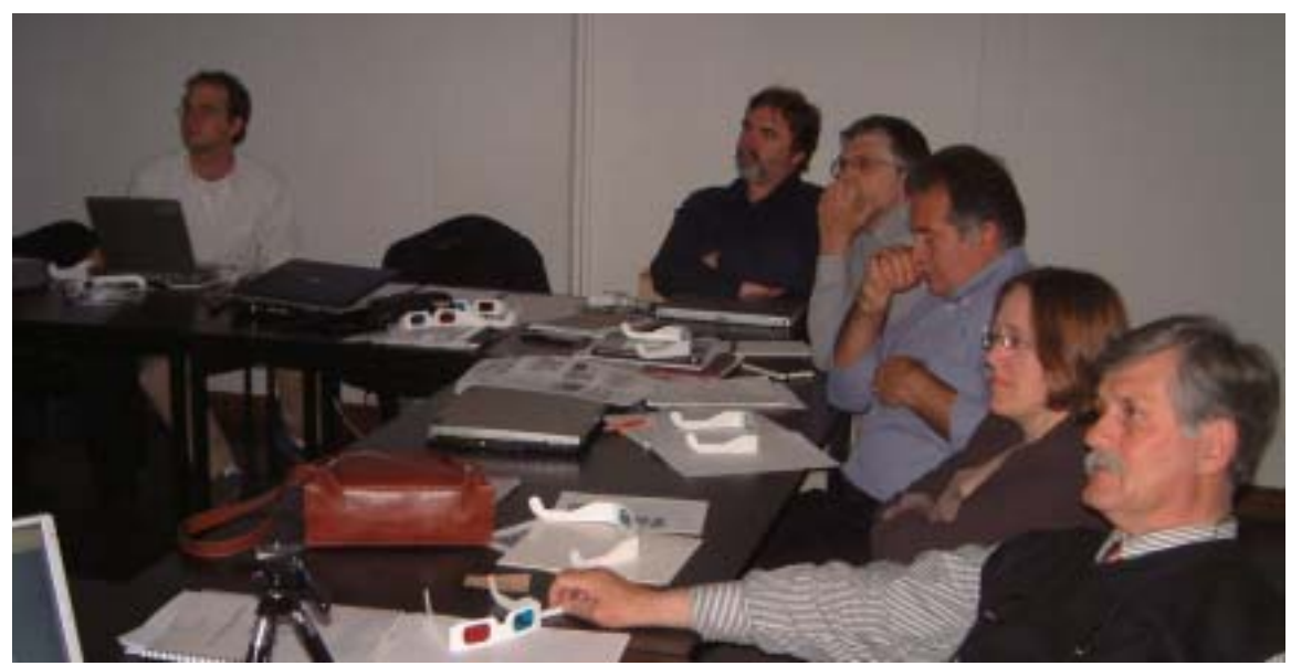
(World Heritage Center's Board Room)