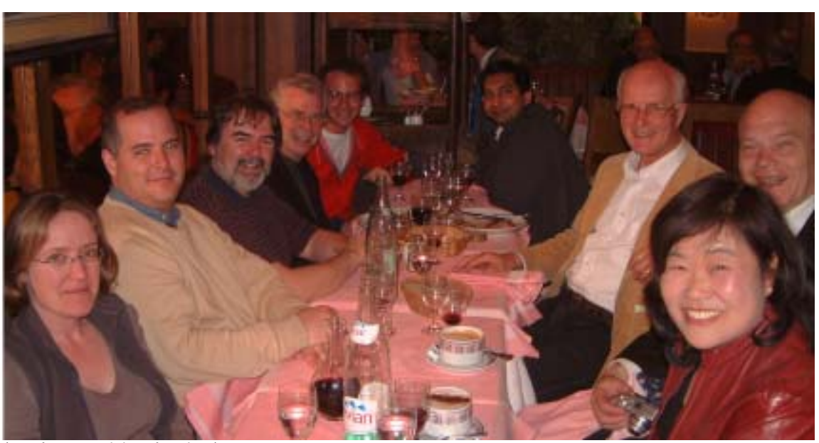
( ... after a good day of work ...)