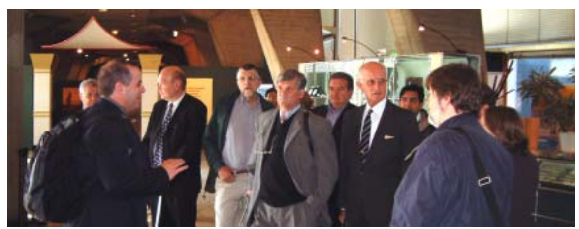
(RecorDIM Partners in lobby at UNESCO, Paris)

As mentioned earlier in this report, Day-2 of the RecorDIM Parners Meeting took place at UNESCO, within the World Heritage Centre's facilities. Most of the day was dedicated to reviewing and discussing task group activities.