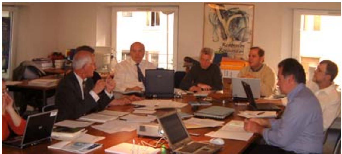
(On May 8, the RecorDIM Partners Meeting took place at the ICOMOS Secretariat in Paris)