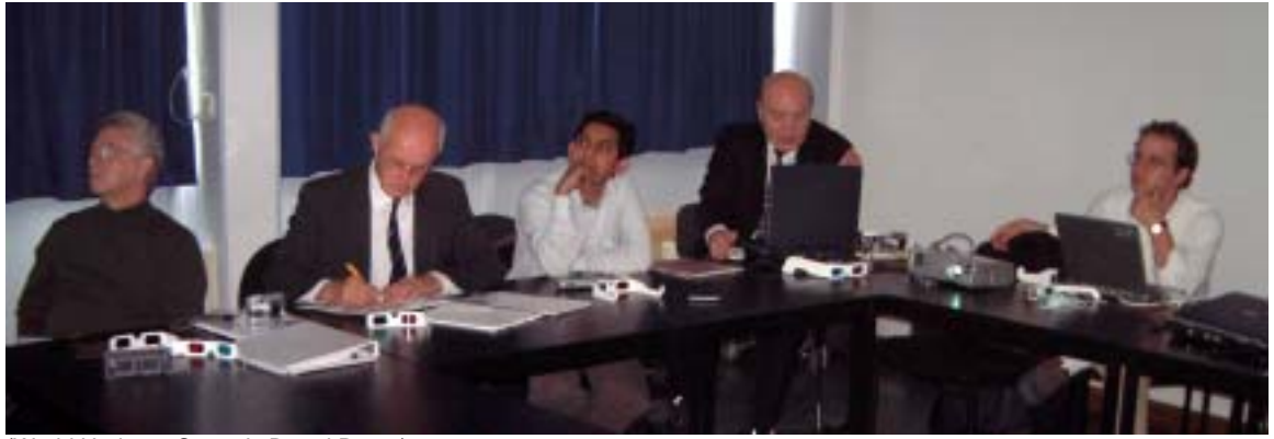
(World Heritage Center's Board Room)