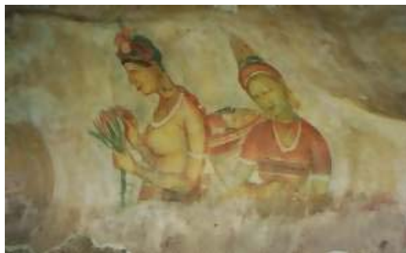
(additional photos of frescos can be seen at: http://sigiriya.org/gallery.htm )