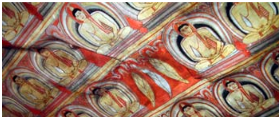
Example of ceiling paintings in cave 2