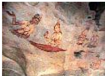
(Frescos on rock face)

... The paintings would have covered most of the western face of the rock, covering an area 140 meters long and 40 meters high. There are references in the Graffiti to 500 ladies in these paintings”