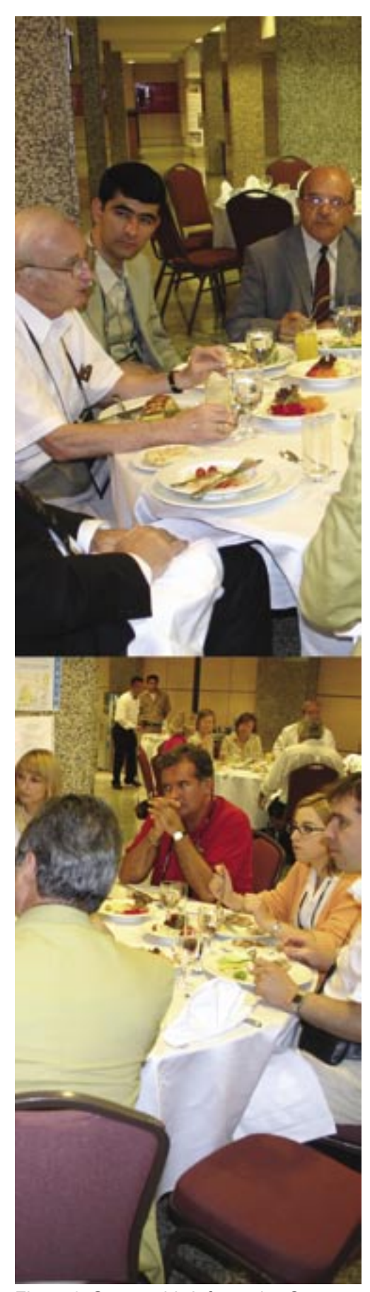
Figure 6: Geographic Information Systems discussion during lunch