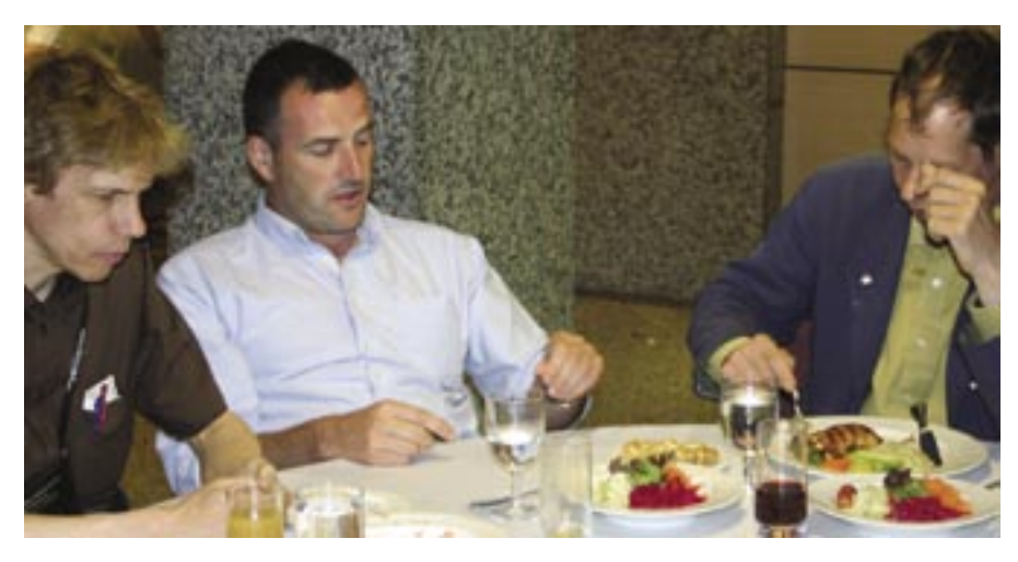
Figure 6: Best practices table

The participants were encouraged to join thematic groups during lunch, in order to identify: